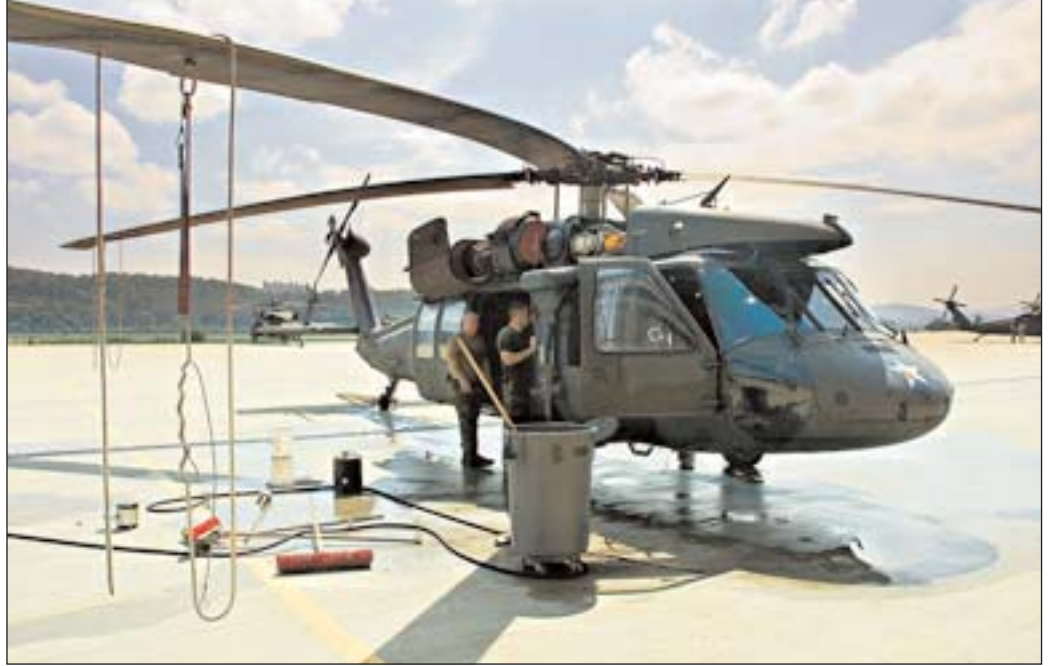
Soldiers conduct maintenance and clean one of the fleet’s Blackhawk UH-60’s.