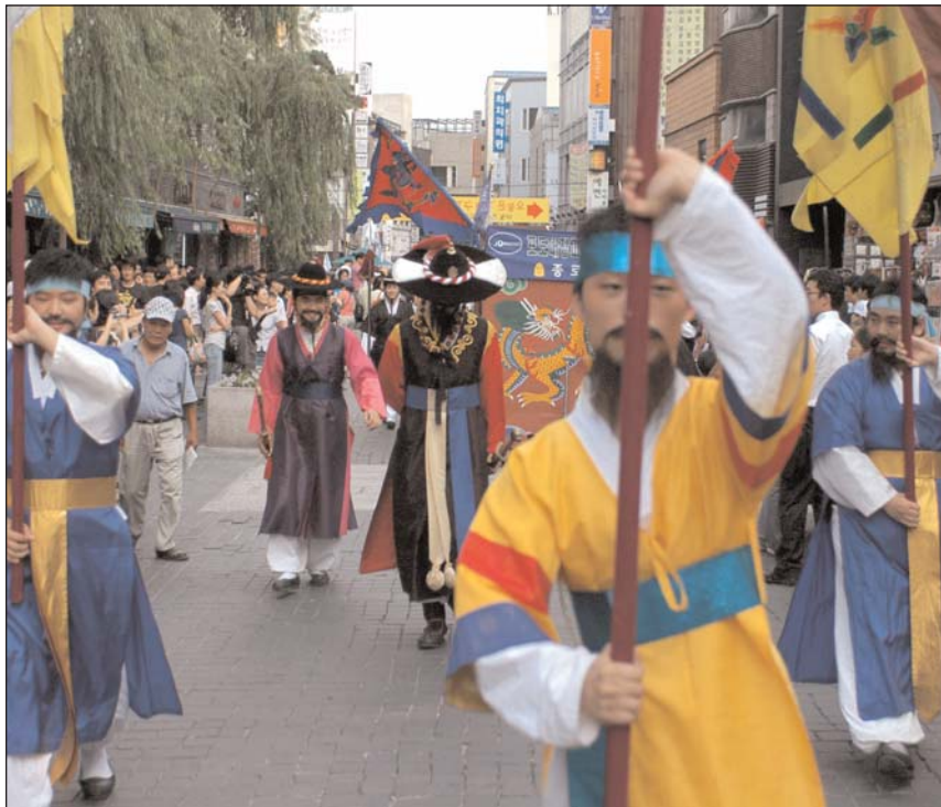
The reenactment of Joseon Dynasty's police officers, Podocheong and Sunragun, is a major event in the street of Insadong on weekends.

2004. "This building is built to extend the horizontal streets of Insadong vertically. On the road, man meets man, man meets object, and man meets culture. That's why there are five entrances to the building but no main gate."