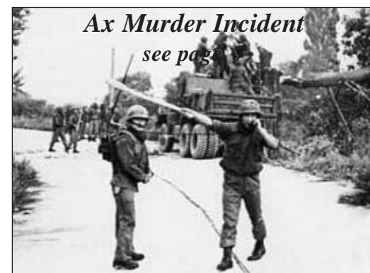
Ax Murder Incident see page 8

Soldier of the Year.....page 3 Manchu Stakes.....page 4 See Korea.....page 8