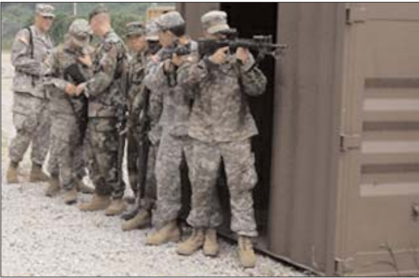
A fire team from A Co, 2-9 Infantry, prepares to enter and clear a room during the urban portion of "Manchu Stakes."

Following the conclusion of Manchu Stakes, the senior NCOs and station NCOICs conducted an After Action Review to identify strengths and weaknesses of the training in order to make it a more effective and relevant training event in the future.